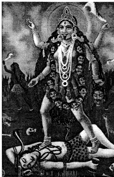
Black Kali Standing On A White Devil

one can say that this or that guru's version is wrong. However, there is something these India gods have in common - each has a serpent about him.