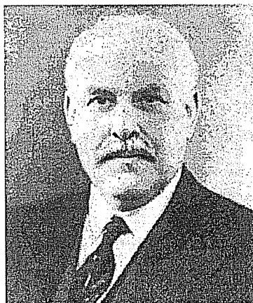
Sir Josiah Stamp (1880-1941)

Even more impressive is their ability to conjure wealth out of thin air. Consider the words of an internationally respected expert in such matters - Sir Josiah Stamp, President of the Bank of England in the 1920s and the 2nd richest man in Great Britain.